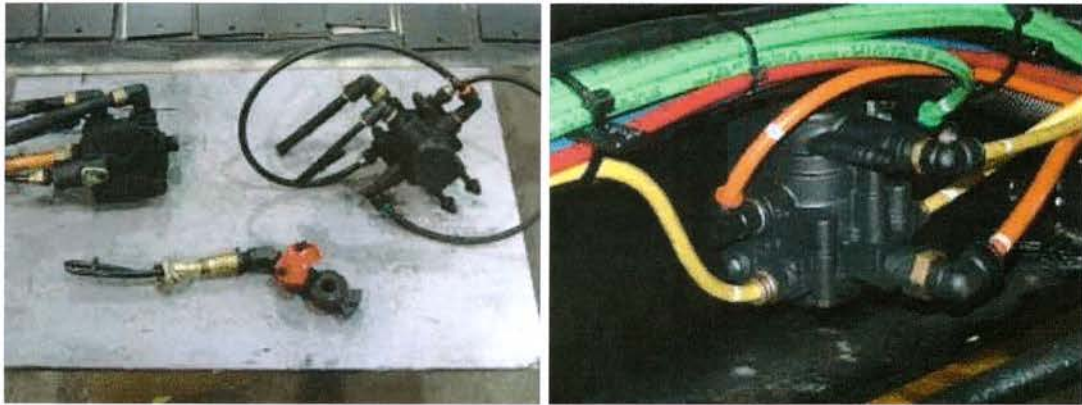
Figure 56. Brake valves and glad hand treated with CORSOL prior to installation (WSDOT & PRP, 2014).