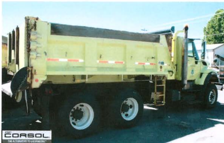
Truck 35 at the Pascoe facility.