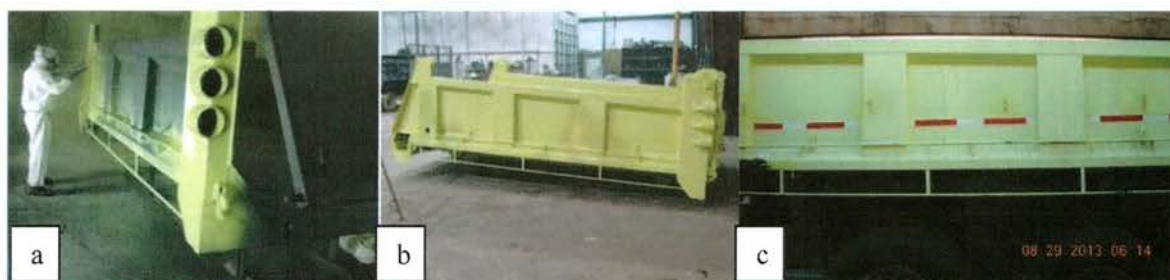
Figure 55. a & b) A new body treated with PRP CORSOL, then top coated with PRP Acrylic Urethane, c) a dump body after 5 years of use on a salt spreader truck (WSDOT & PRP, 2014).

PRP Industries entered into a corrosion test study with WSDOT. PRP Industries will perform a series of field studies using WSDOT plow trucks to identify cost effective solutions to corrosion problems on these vehicles (WSDOT & PRP, 2014). This study will help to identify solutions to corrosion on vehicle frames, fuel tanks, wheels, air valves, dump bodies and various other components. The test will be conducted on new trucks and components going into service and examples are shown in Figure 55, Figure 56, and Figure 57. The two trucks went into service December 2008.