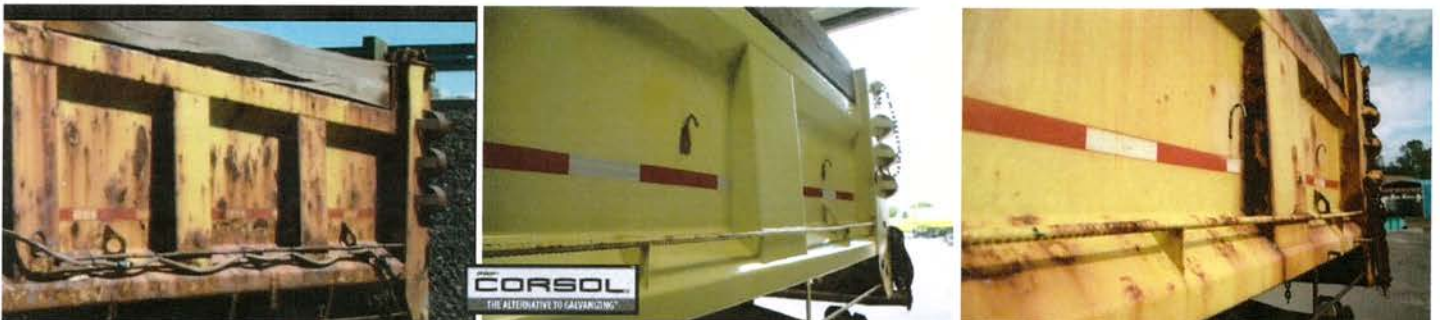
Unit 34. The front gate and the ladder were painted utilizing the WS DOT standard paint system