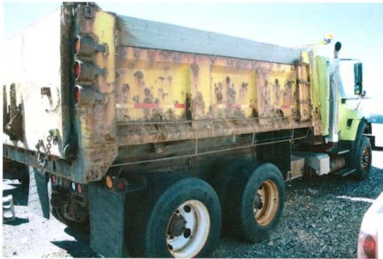
Truck 34 at the Pascoe facility.