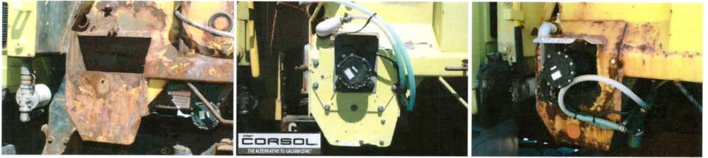
Close-up of the driver's side of trucks 33, 34 and 35.