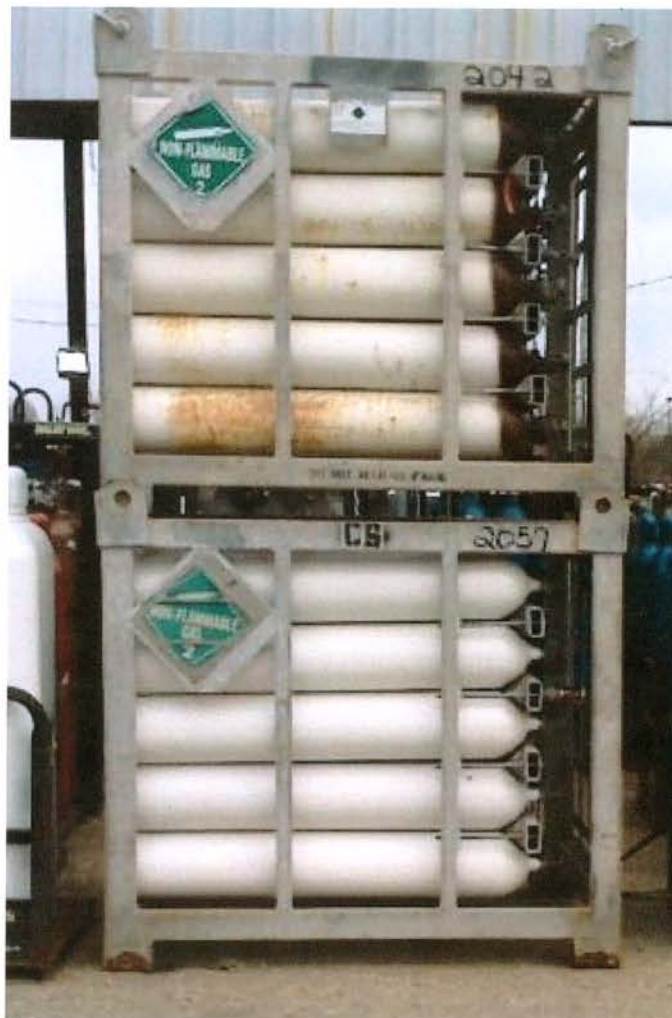
Figure 60. The standard cylinder group on top compared to the PRP treated cylinders on the bottom (PRP, 2014).

Gas cylinders that were being sent offshore were corroding within a year. The corrosion caused pitting of the steel, which reduced the service life of the gas cylinders. A Corsol Metal Treatment System was applied to mitigate the corrosion problem (Figure 60). This same treatment technique has been used to successfully protect the fuel tanks (PRP, 2014).